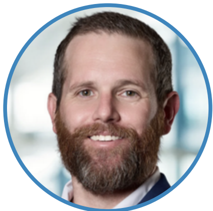
William Floyd Vista Site Selection